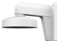
Indoor/Outdoor wall mount DS-1272ZJ-120